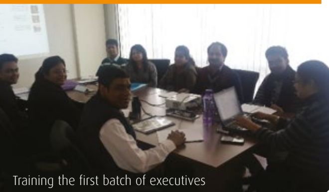
Training the first batch of executives