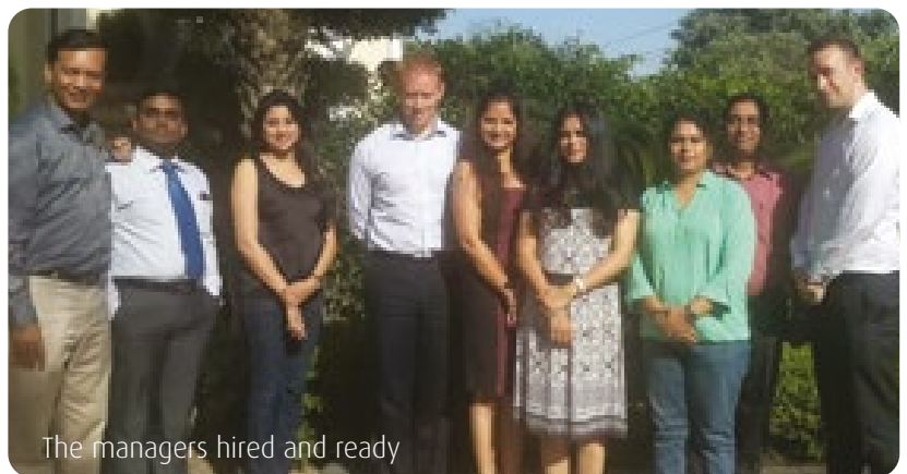
The managers hired and ready

STABILIZATION: Excellent feedback from the client during regular governance meetings. Exceeded expectations of the client with the sheer pace in quickly setting up their Indian Legal Entity, as also the quality of the deliverables. Not to mention, the cost of establishment and market entry was very favourable. Ongoing activities include presence as a Board member, Governance review of Operations and helping with Leadership coaching and handling employee grievances.